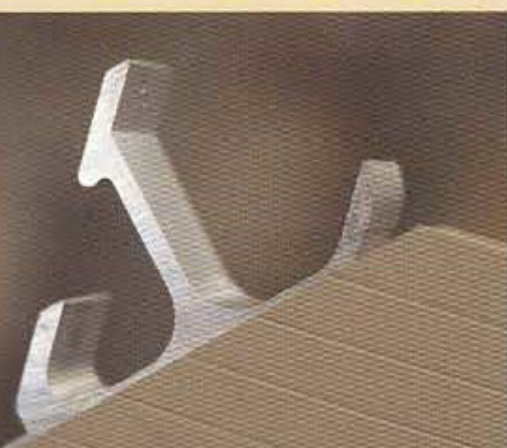
EXTRA HEAVY CORNER GUSSETS