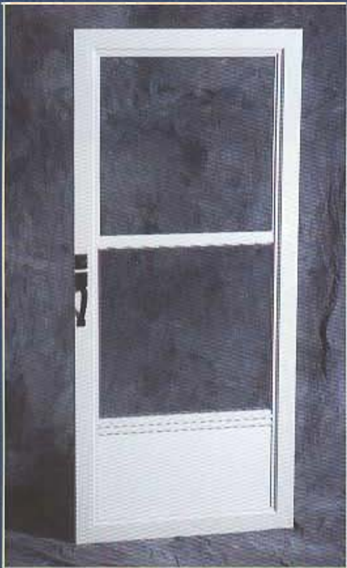
BRONZE 726 WHITE 727

Quality Storm Doors Built to Last a Lifetime.