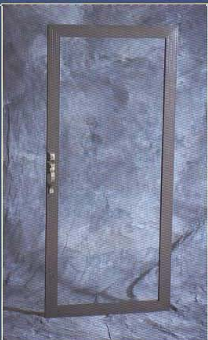
BRONZE 766 WHITE 767 TAN 768