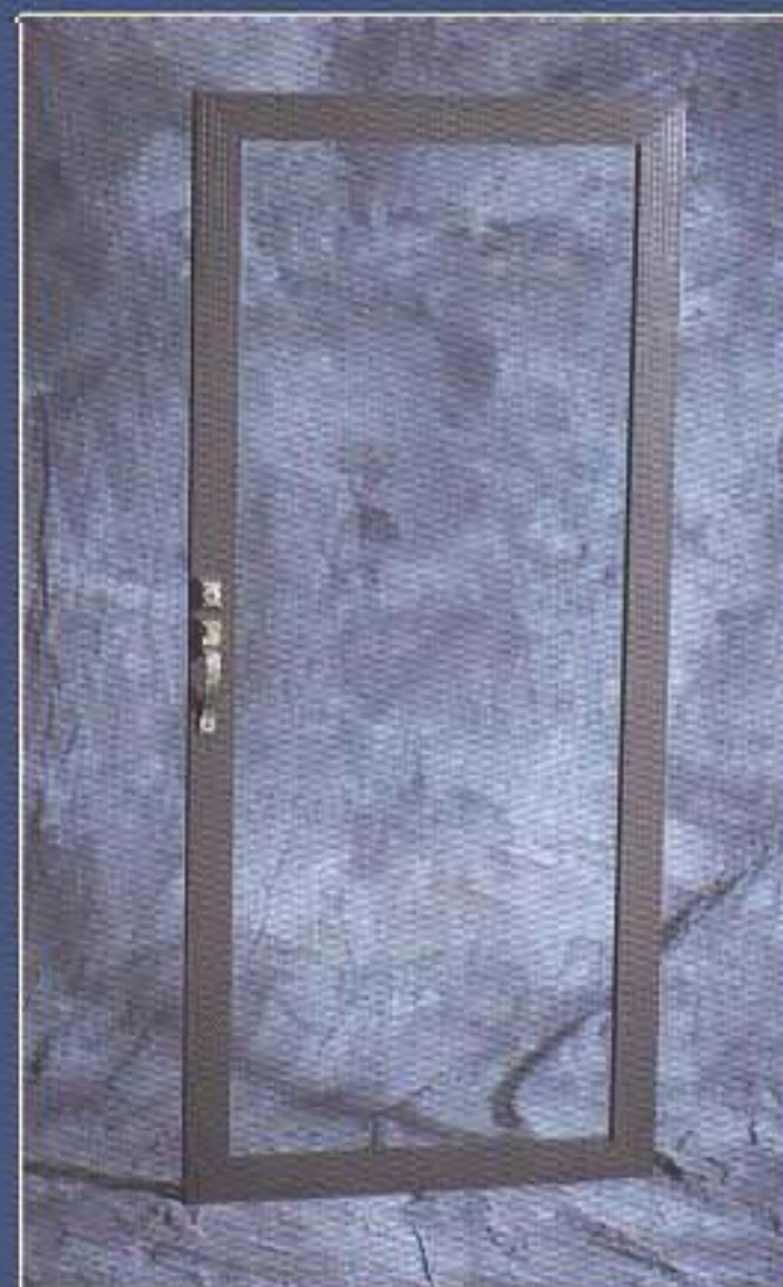
BRONZE 816 WHITE 817 TAN 818