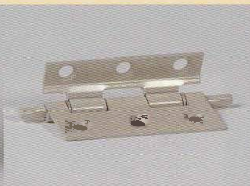
HEAVY DUTY HINGES