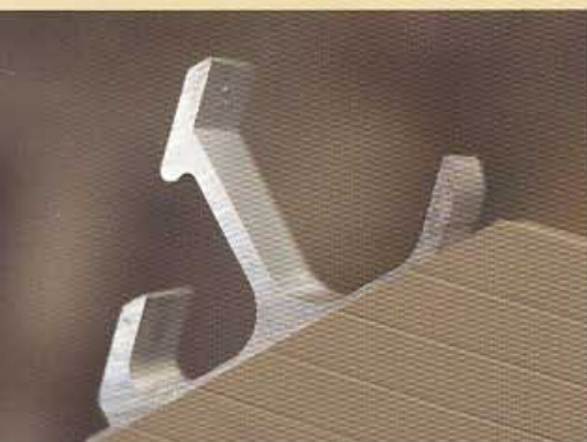
EXTRA HEAVY CORNER GUSSETS