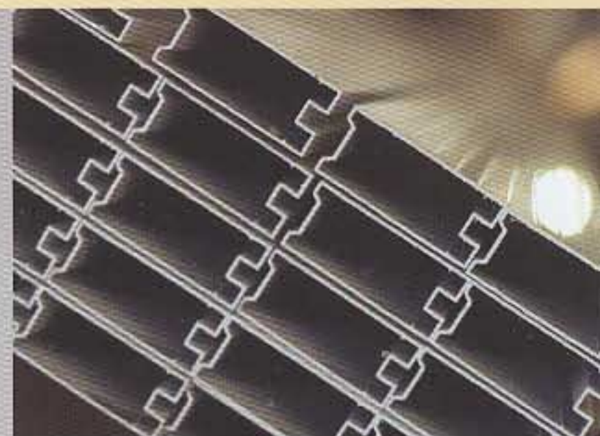
EXTRUDED TUBULAR MAIN FRAMES