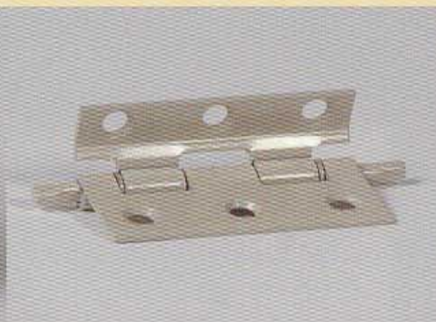
HEAVY DUTY HINGES